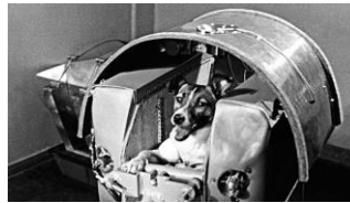
Laika the astronaut