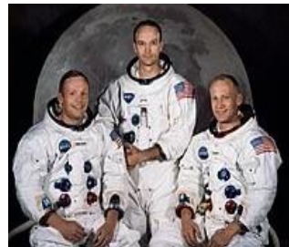
The Apollo 11 crew