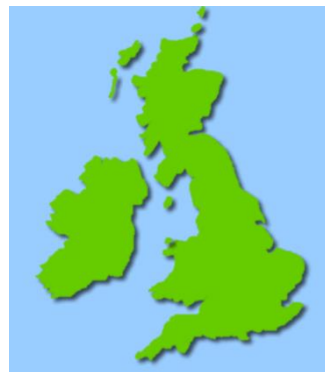
A map of the United Kingdom .